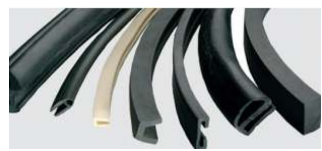
IRPC manufacture Rubber Extruded Proles in Natural, Nitrile, Neoprene, silicon, Viton and EPDM