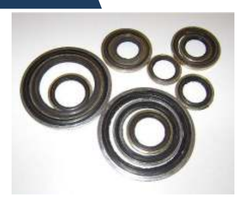
IRPC Manufactures BSP Dowty Seals in the following sizes:

1/8" 1/4" 3/8" 1/2" 3/4" 1" 11/4" 11/2" 2"