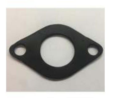
Rubber for all the Water pumps