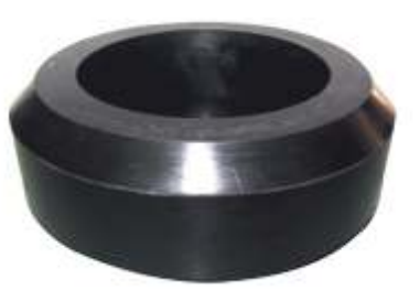
Packer Elements Nitrile Downhole