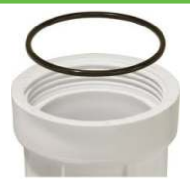
Available in Food Grade