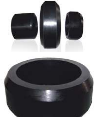
IRPC Manufactures all sizes of Neoprene Gaskets upto 1000 mm Diameter at very competetive rates.